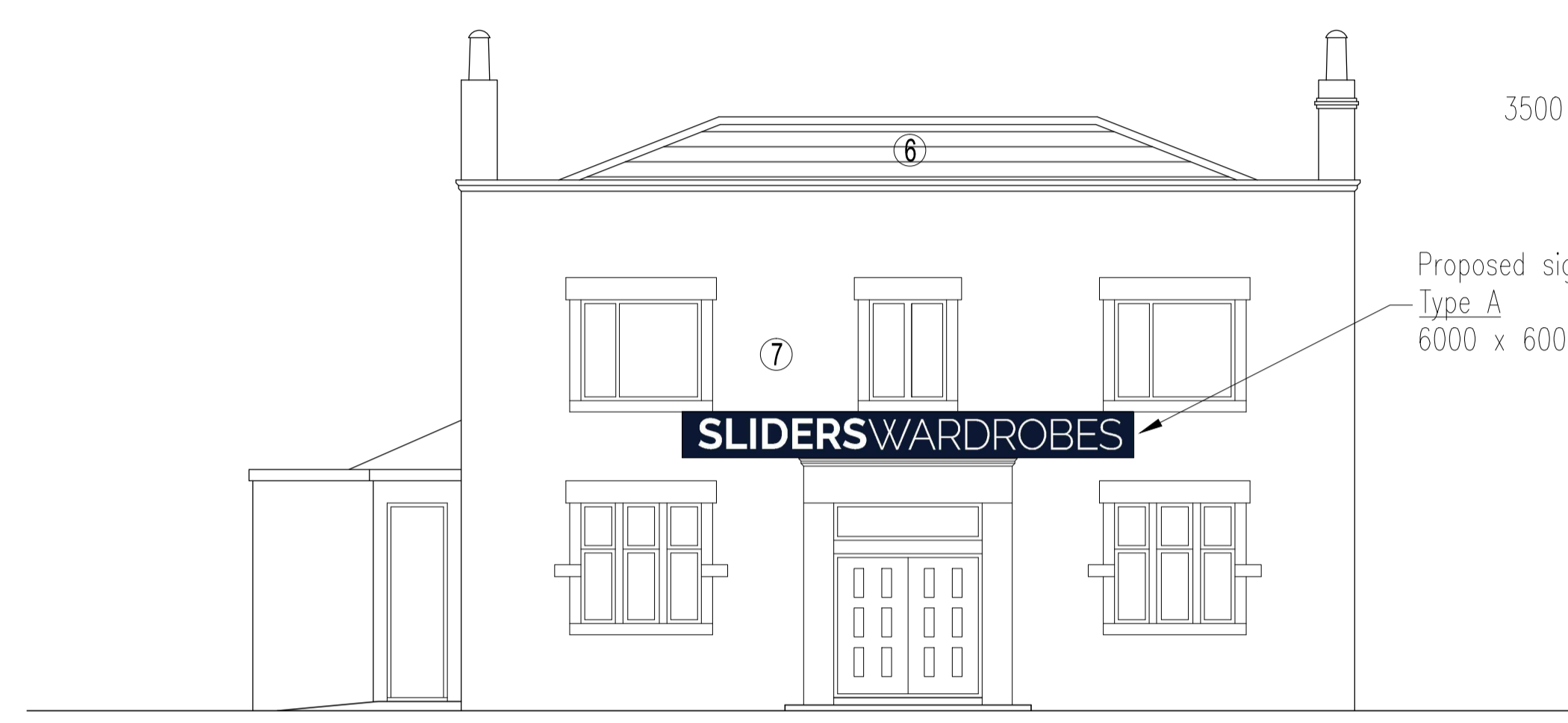
PROPOSED SOUTH ELEVATION SCALE 1/75