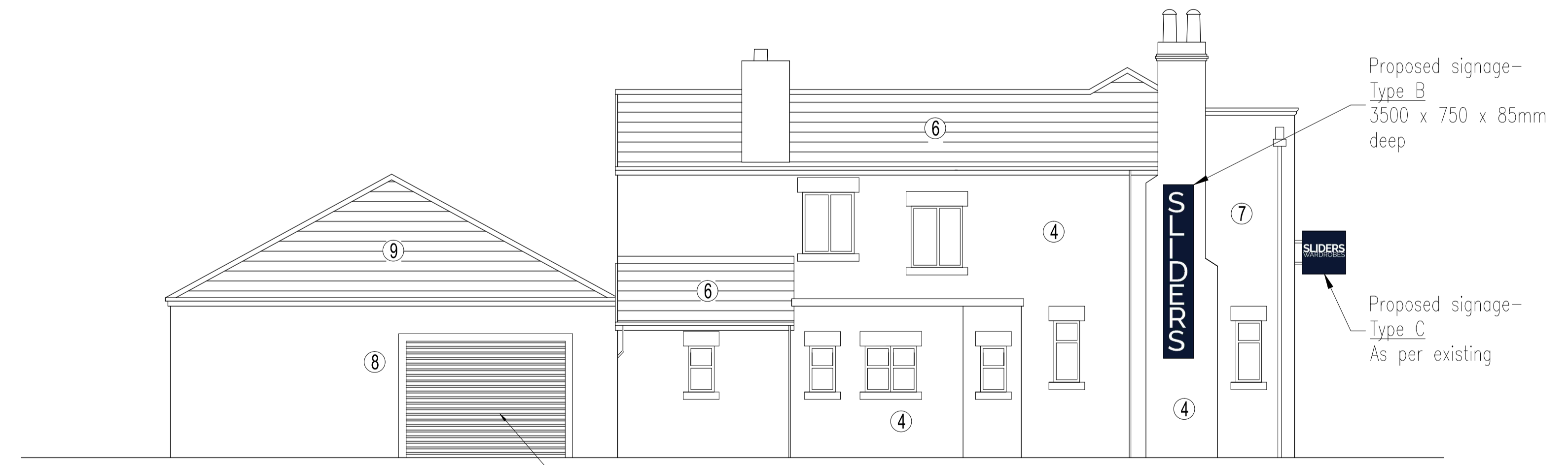
PROPOSED WEST ELEVATION SCALE 1/75