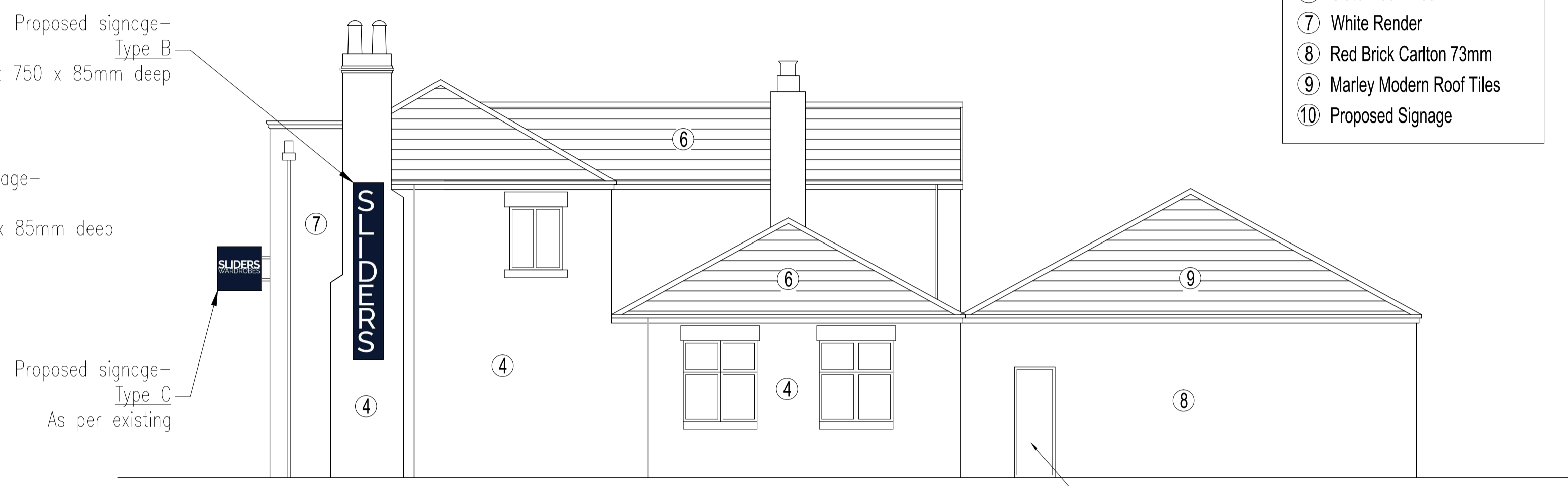
PROPOSED EAST ELEVATION SCALE 1/75