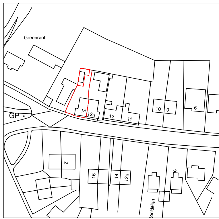
LOCATION PLAN SCALE 1:1250 AT A3