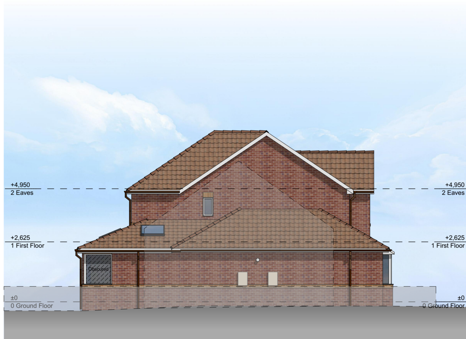
Proposed NE Elevation