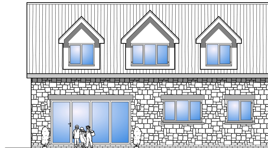
Rear Elevation as Proposed.