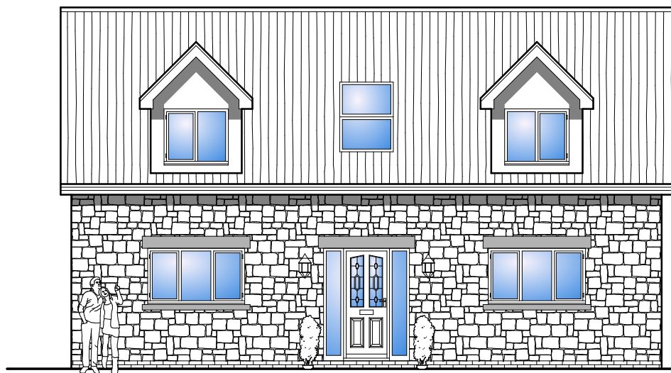
Front Elevation as Proposed.

DRAWING PREPARED BY: MARK GARFITT, ARCHITECTURAL TECHNOLOGIST. Tel: 07789 996636 Email: mark@mgarchitecturaldesigns.co.uk