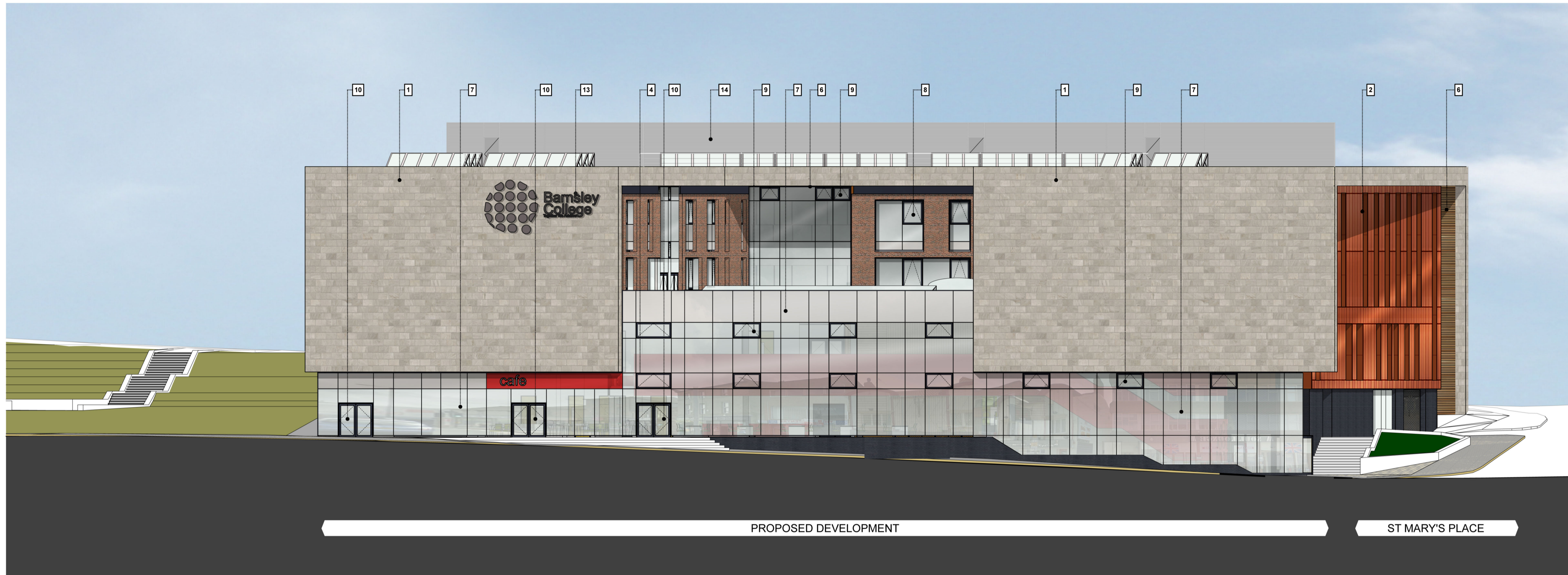
SOUTH EAST ELEVATION - SHAMBLES STREET

This document is © Bond Bryan Architects Ltd. If in doubt ASK. Drawing measurements shall not be obtained by scaling. Verify all dimensions prior to construction. Immediately report any discrepancies on this document to the Architect. This document shall be read in conjunction with associated models, specifications and related consultant's documents.