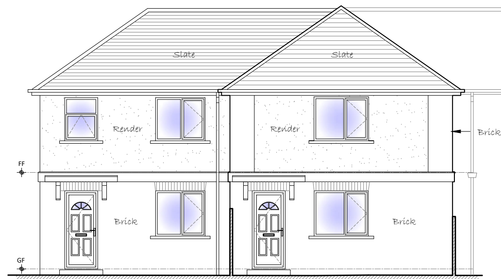
PROPOSED SOUTH ELEVATION SCALE - 1:100