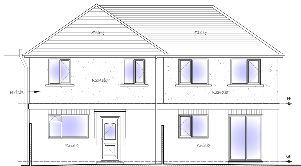
PROPOSED NORTH ELEVATION SCALE - 1:100

Fascia/Guttering - White upvc fascia board with black guttering and downpipes to suit.