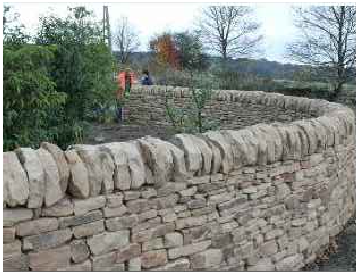
Dry stone walling feature to entrance bellmouths. (behind Visibility Splays) approx 1500 high min 25m length (each) built using local / reclaimed stone by a Local Stonemason