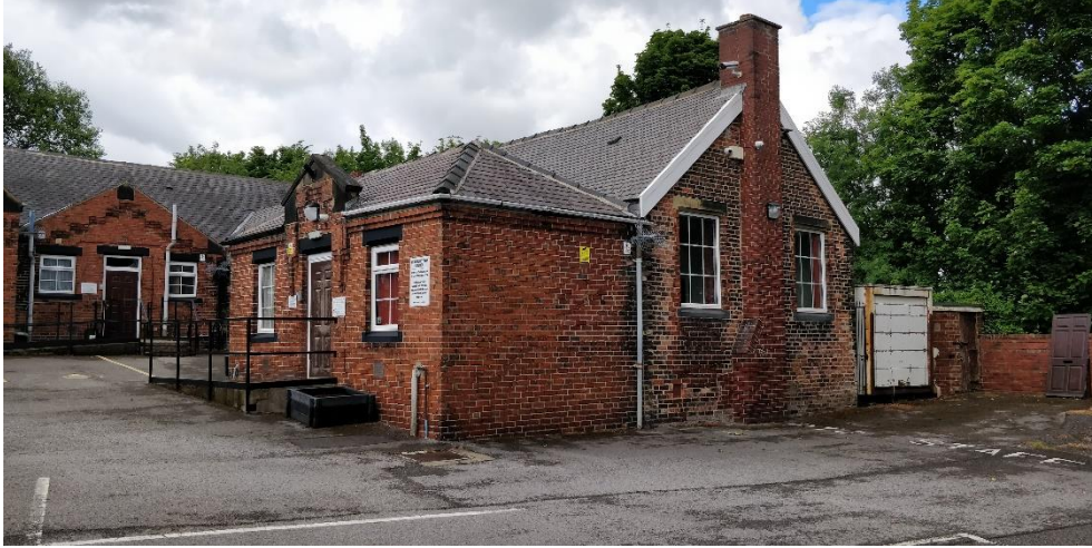
Existing East elevation of St John's Community Centre

Heritage Impact Assessment to accompany application for full planning permission at St.John's Community Centre, Church Street, Penistone, Sheffield, S36 6AR.