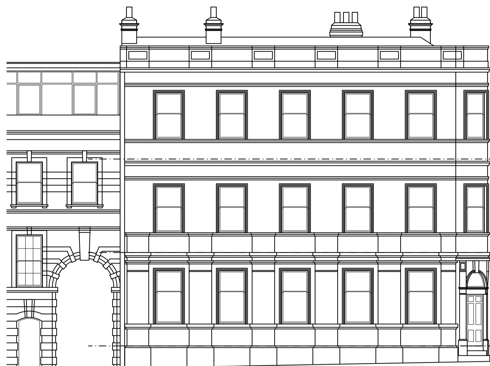
WEST ELEVATION - ROYAL STREET