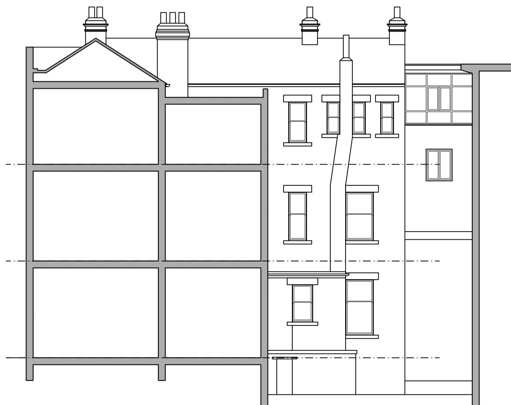
EAST ELEVATION - COURTYARD