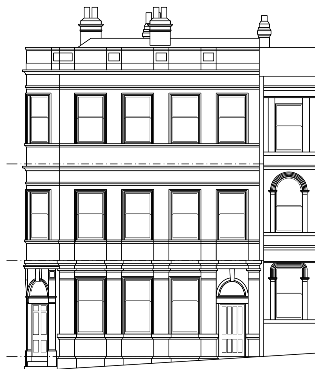
NORTH ELEVATION - REGENT STREET

Drawing based on Ordnance Survey and/or existing record drawings - design and drawing content subject to Site Survey, Structural Survey, Site Investigations, Planning and Statutory Requirements and Approvals.