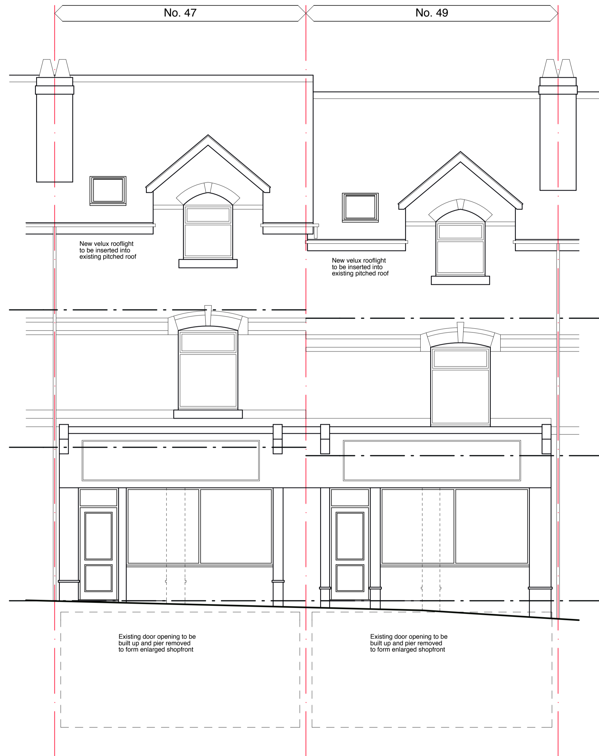
PROPOSED PARK ROAD / FRONT ELEVATION