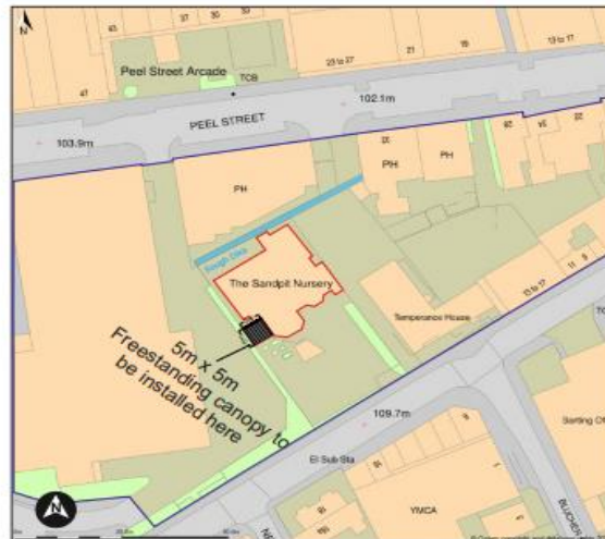
1st Safari Day Nurseries, Nursery, Pitt Street, Barnsley, S70 1AL

The application relates to a nursery which is located to the North of Pitt Street in Barnsley Town Centre. The nursery is a part single storey, part two-storey building constructed of red brick with pitched roofs. The site lies to the south of Che Bar and Cocos nightclub, to the east of Lidl and Home Bargains and to the west of Temperance House. To the front of the site is a large parking area.