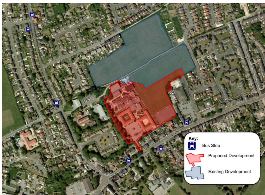
Figure 2.9 – Locations of bus stops near to the development site

2.3.3 As can be seen in Figure 2.9, there are various bus stops adjacent to the existing site access on Midland Road as well as to the east of the junction with The Lane.