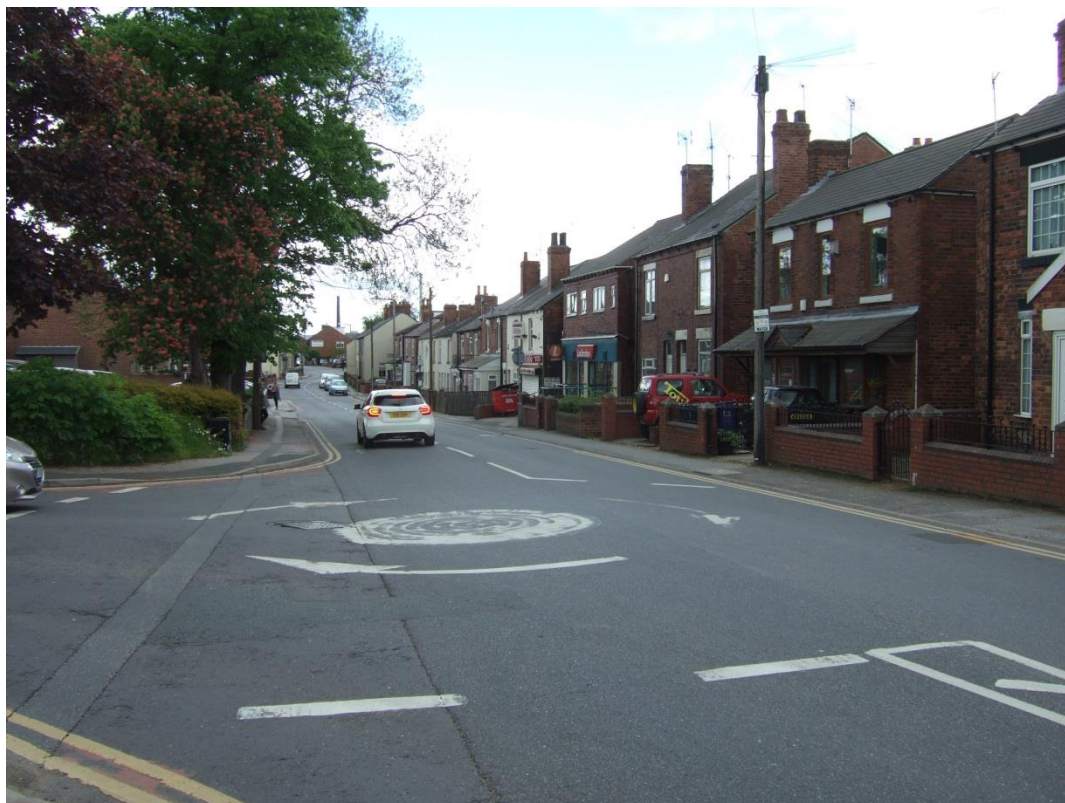
Figure 2.6 – Photos of Midland Road / The Lane mini roundabout

2.2.8 As with Midland Road, Station Road has a number of properties fronting the highway.