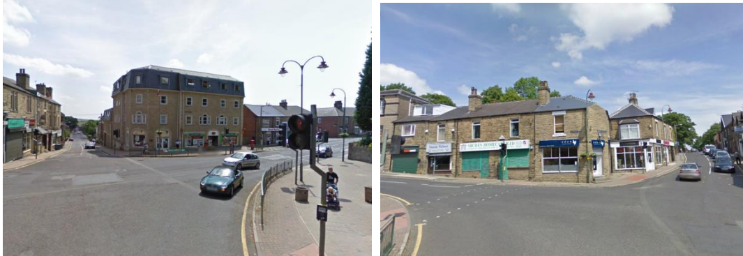
Figure 2.4 – Photos of Midland Rd / High St / Station Rd / Church St junction