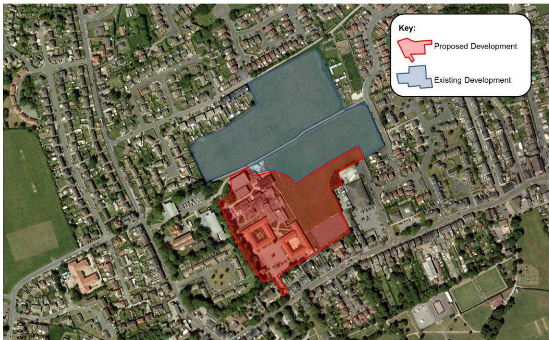
Figure 2.1 – Location of Development Site

2.1.2 As can be seen in Figure 2.1, the former Royston High School site has a vehicle access located on Midland Road. However, this access is not currently in use following the school closure. A selection of photos, showing this existing access point is provided in Figures 2.2 and 2.3.