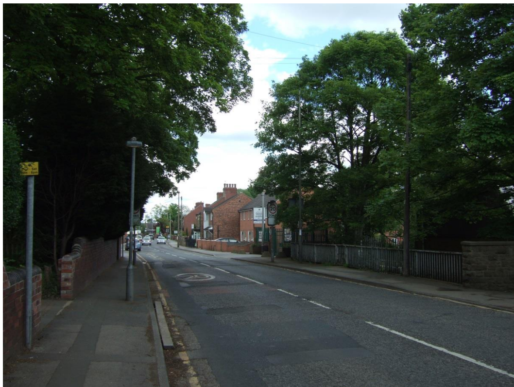
Figure 2.5 – Photos of Midland Road Traffic Calming Measures

2.2.6 In terms of the existing land use, Midland Road currently has a mixture of both housing and retail units. There are two distinct retail areas within Royston; one on Midland Road near to the junctions with Park View and Milgate Street and the other, known as The Wells, in the vicinity of the Midland Road / Church Street / High Street and Station Road junction.