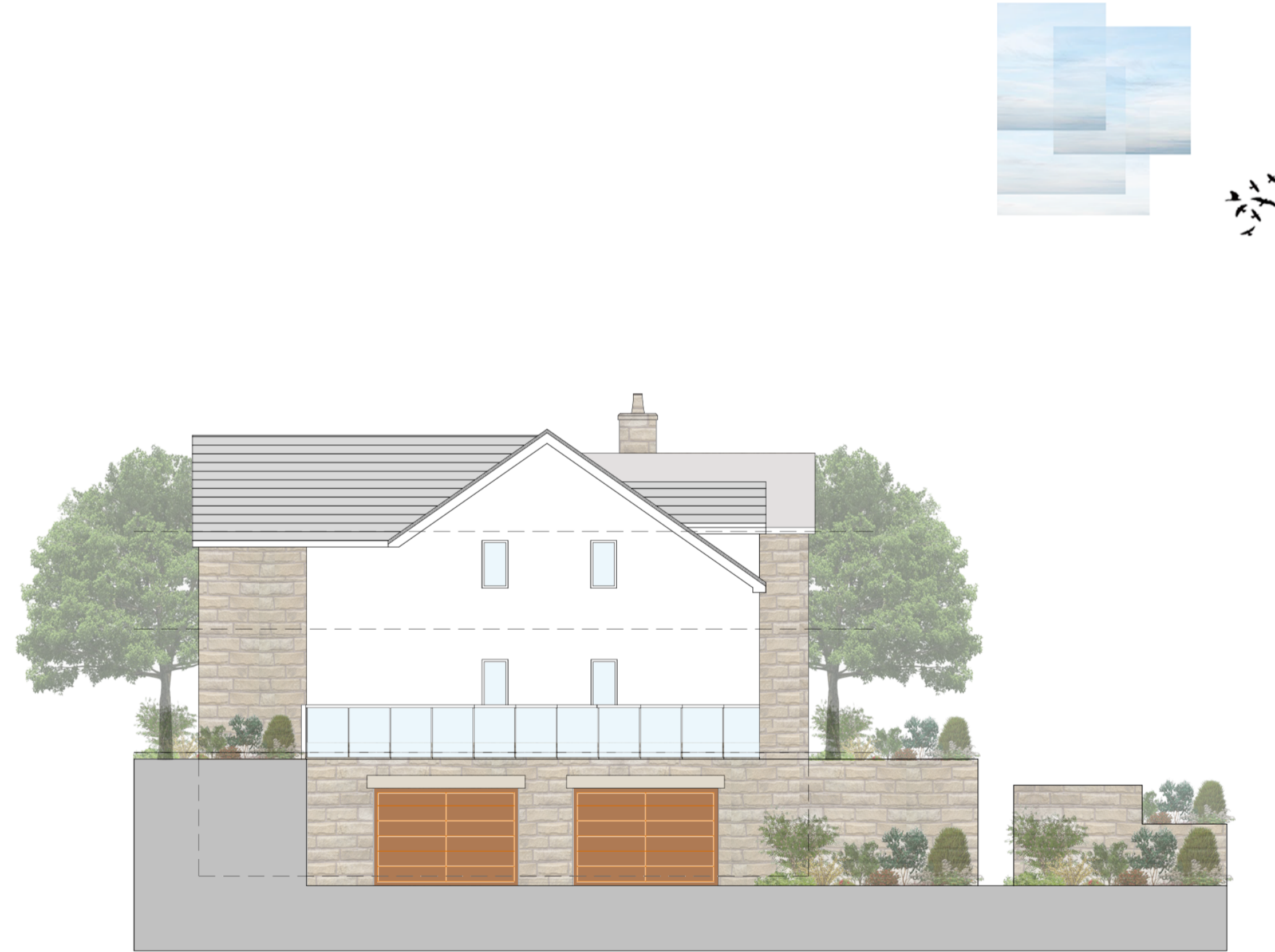
SIDE ELEVATION AS EXISTING Scale 1:100