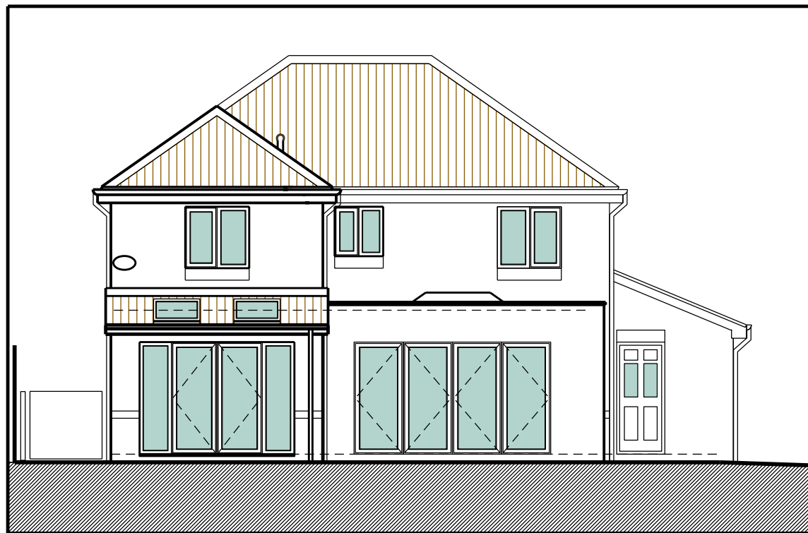
South Elevation - Proposed