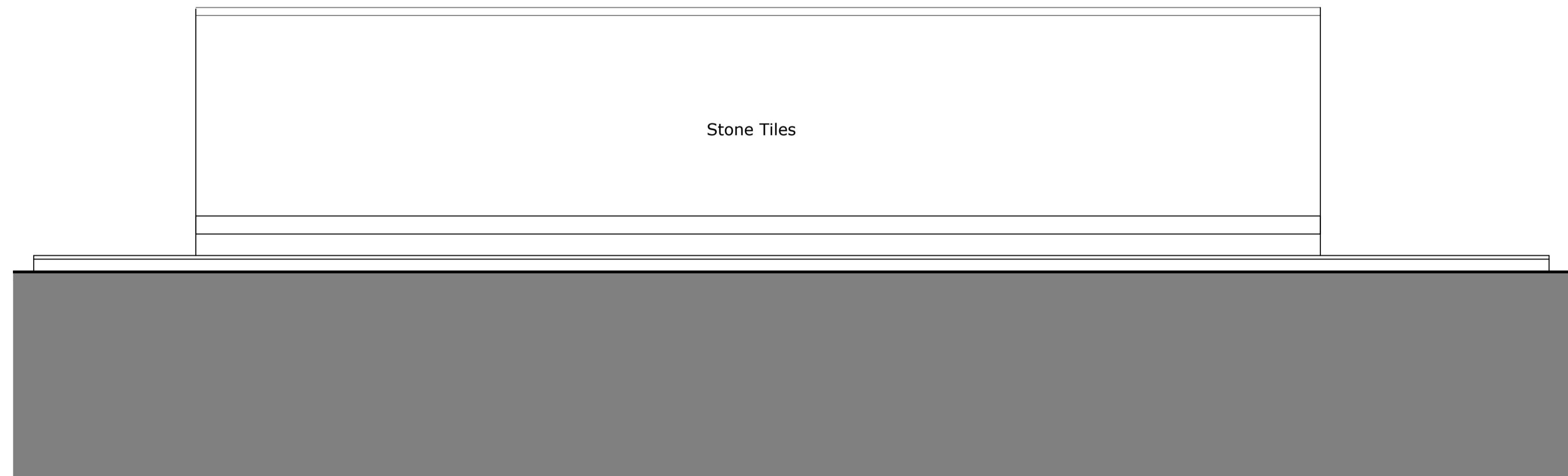
Proposed Rear Elevation - 1:50